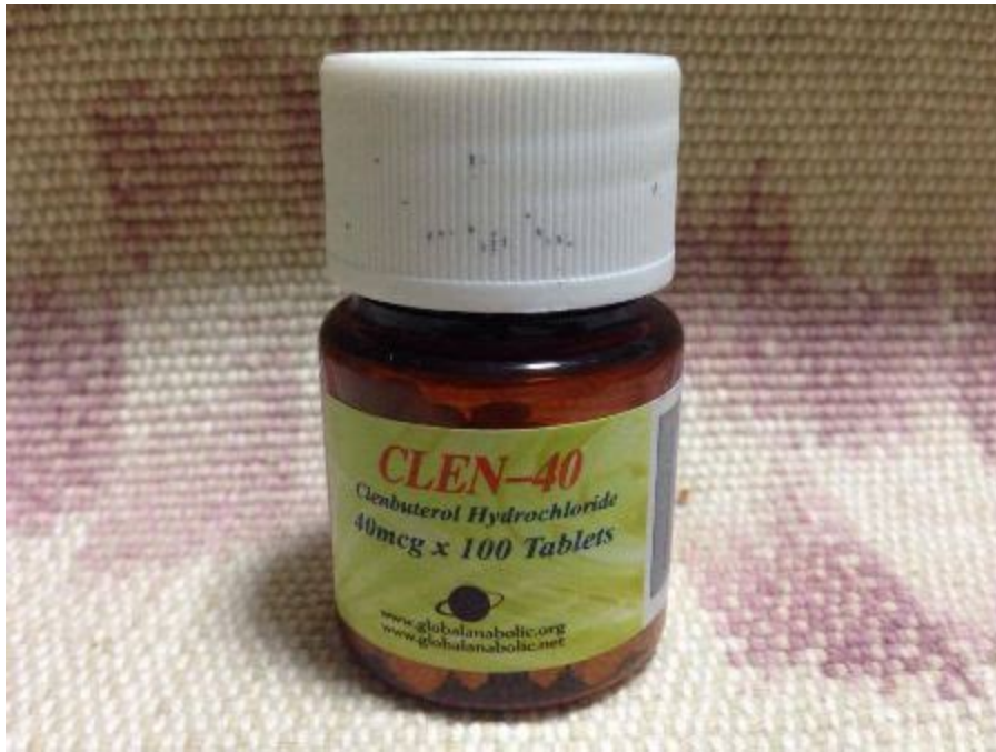
ZOMACTON 10 mg vial

contains recombinant somatotropin 10 mg, mannitol 10 mg, disodium phosphate dodecahydrate 3.57 mg, and sodium dihydrogen phosphate dehydrate 0.79 mg. The 10 mg vial is supplied in a combination package with an accompanying 1 ml syringe of diluting solution. The diluent contains bacteriostatic water for injection with 0.33%. ZOMACTON 10 mg vial contains recombinant somatotropin 10 mg, mannitol 10 mg, disodium phosphate dodecahydrate 3.57 mg, and sodium dihydrogen phosphate dihydrate 0.79 mg. The 10 mg vial is supplied in a combination package with an accompanying 1 mL syringe of diluting solution. The diluent contains bacteriostatic water for injection with 0.33%.