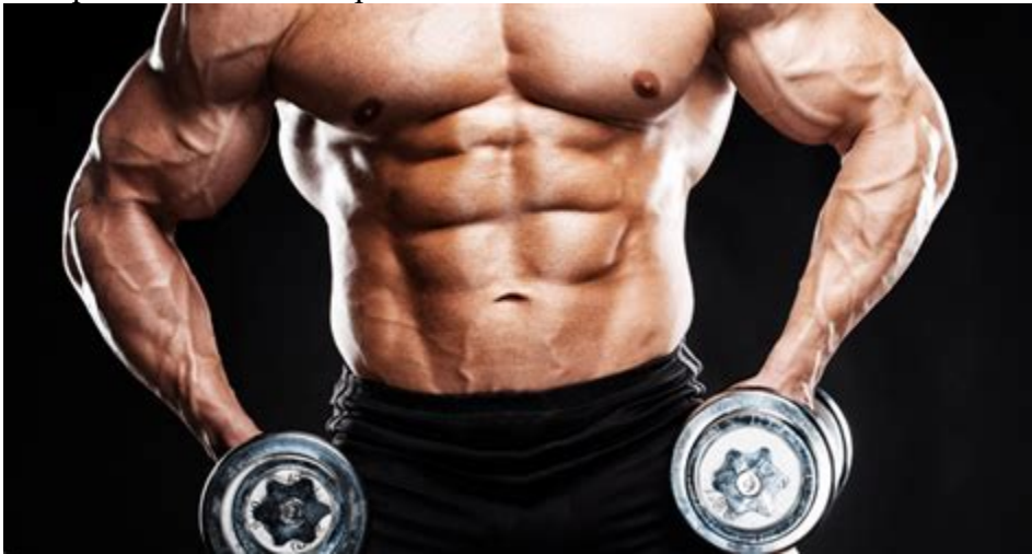
Stanozolol suspension U.S.P.

Buy Magnus Pharmaceuticals anabolic steroids online. Magnus Pharmaceuticals for sale. Best prices.. Winstrol Depot, 50 mg / amp, 1 amps. 5 €. Magnus Pharmaceuticals PVT is one of the largest privately held pharmaceutical companies in India.