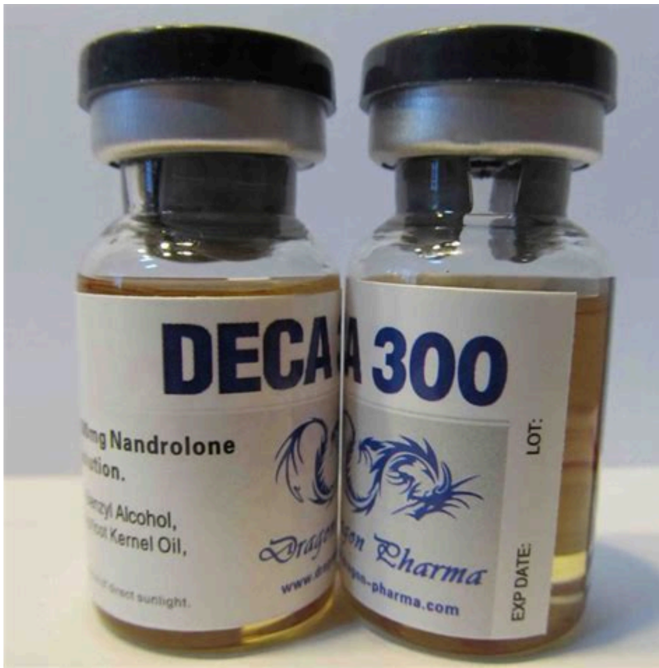
Injections with Testosterone

cypionate come in different sizes - from 200 to 2000mg. Respectively the price of the product varies between $30 and $140. It must be taken every 2 to 4 weeks in doses of 50 to 400 mg. Thus, therapy with testosterone cypionate costs around $30 - $60 per month. lowest price