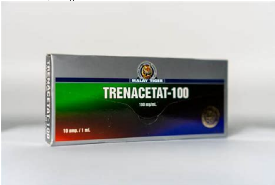
The Difference Between Test

Enanthate has a 7-carbon ester chain while cypionate has an 8-carbon ester chain. The more carbons the ester group has, the more soluble in oil and the less soluble in water it becomes. As a result, cypionate has a slightly slower release and longer active life. Due to being one atom lighter, enanthate has more testosterone per mg.