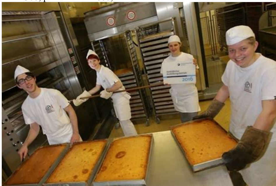
Phenom Pharma product

which are filled with cheap peptide imitations. We welcome you to test our HGH and see for yourself. pharma oxy 50. oxymetholone; 50 mg/ml; 1; view more info > testosterone. pharma test 100; pharma test 100 oil base; pharma test p 100; pharma test ph 100; pharma test e 300; pharma test e 500; pharma test c 250; pharma sust 300; pharma sust 500; pharmatest p50; nandrolones. pharma nan ph 100; pharma nan d 300; pharma nan d 600;