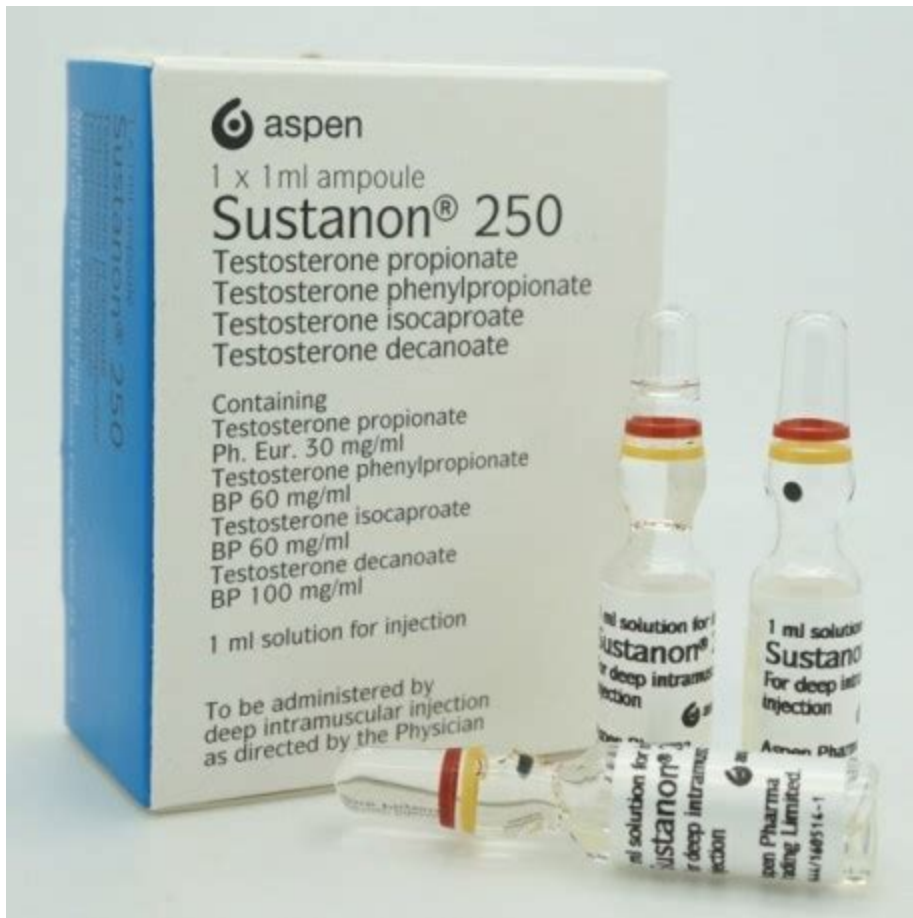
Trenbo H (Parabolan) - 10 ML VIAL (75 MG/ML) ASLAN PHARMA. $135.00. $114.00. DETAILS. weblink