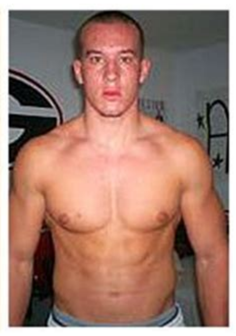
Hygetropin HGH 100iu Cycle. The average Hygetropin dosage is within 5 - 15 units daily. Effective dosages are selected exclusively individually (as usual, the athlete begins with a minimum dose of growth hormone and slowly increasing it until he finds the most effective and safe for himself). <u>view publisher site</u>