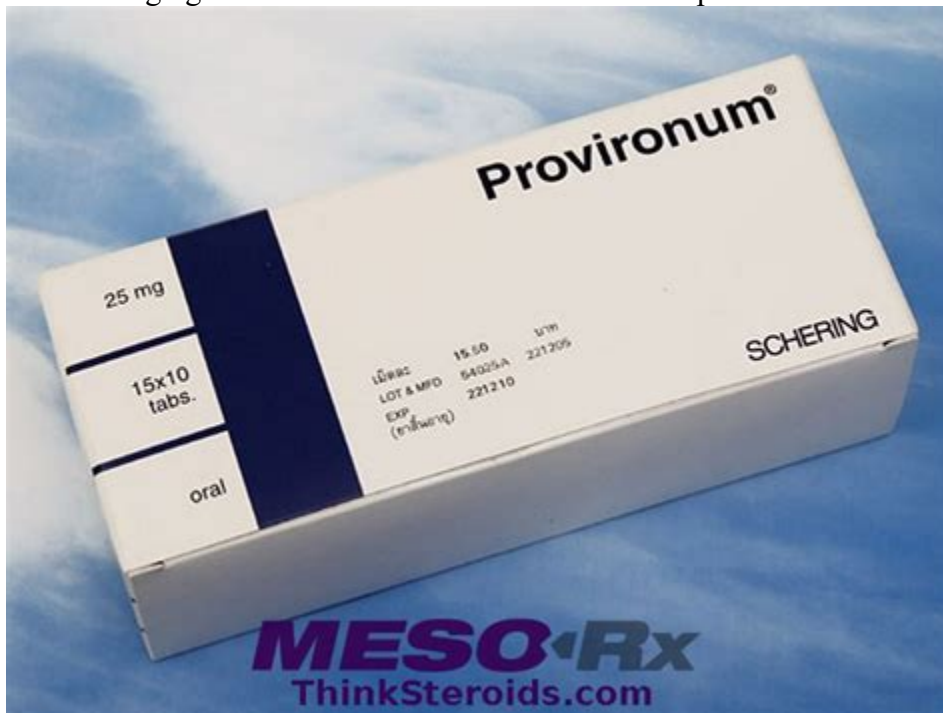
Hgh Humatrope pen lilly

injection. $195. Eli Lilly 72iu/24mg Humatrope HGH injection pen. 177 in stock. Humatrope 72iu Pen HGH injection quantity. Add to cart. SKU: hp72 Category: HGH Tags: HGH Pens, Pharma Grade HGH. Description. Buy Humatrope 72iu online - Buy Humatrope Canada - Buy Humatrope HGH - Humatrope Pen For Sale UK - Humatrope - Humatrope Pen. Humatrope is a man-made form of human growth hormone. It was first approved in 1987 to treat children who are growing slowly because they do not make enough growth hormone on their own. Humatrope is available.