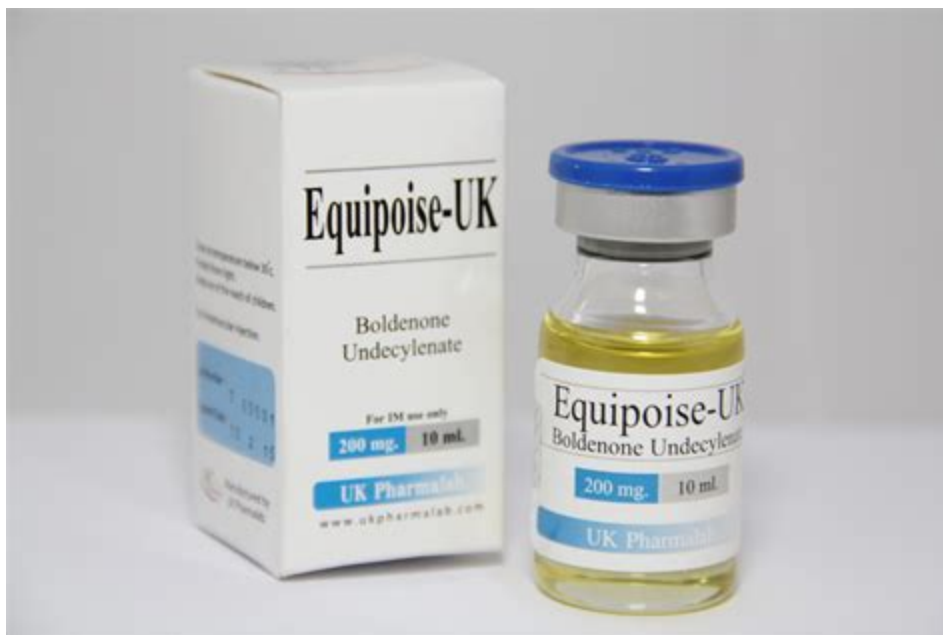
Humatrope 72iu Pen HGH

injection. $195. Eli Lilly 72iu/24mg Humatrope HGH injection pen. 177 in stock. Humatrope 72iu Pen HGH injection quantity. Add to cart. SKU: hp72 Category: HGH Tags: HGH Pens, Pharma Grade HGH. Description. Buy Humatrope 72iu online - Buy Humatrope Canada - Buy Humatrope HGH - Humatrope Pen For Sale UK - Humatrope - Humatrope Pen. Humatrope is a man-made form of human growth hormone. It was first approved in 1987 to treat children who are growing slowly because they do not make enough growth hormone on their own. Humatrope is available.